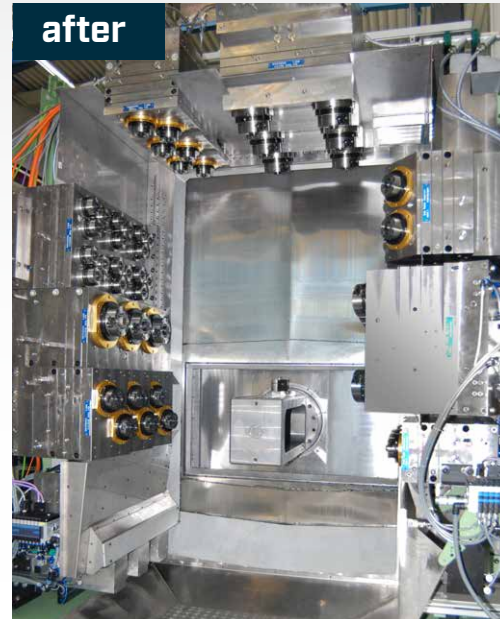
Production Module FM 4+X before and after refurbishment